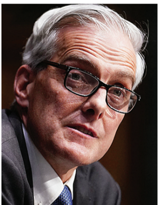
Denis McDonough