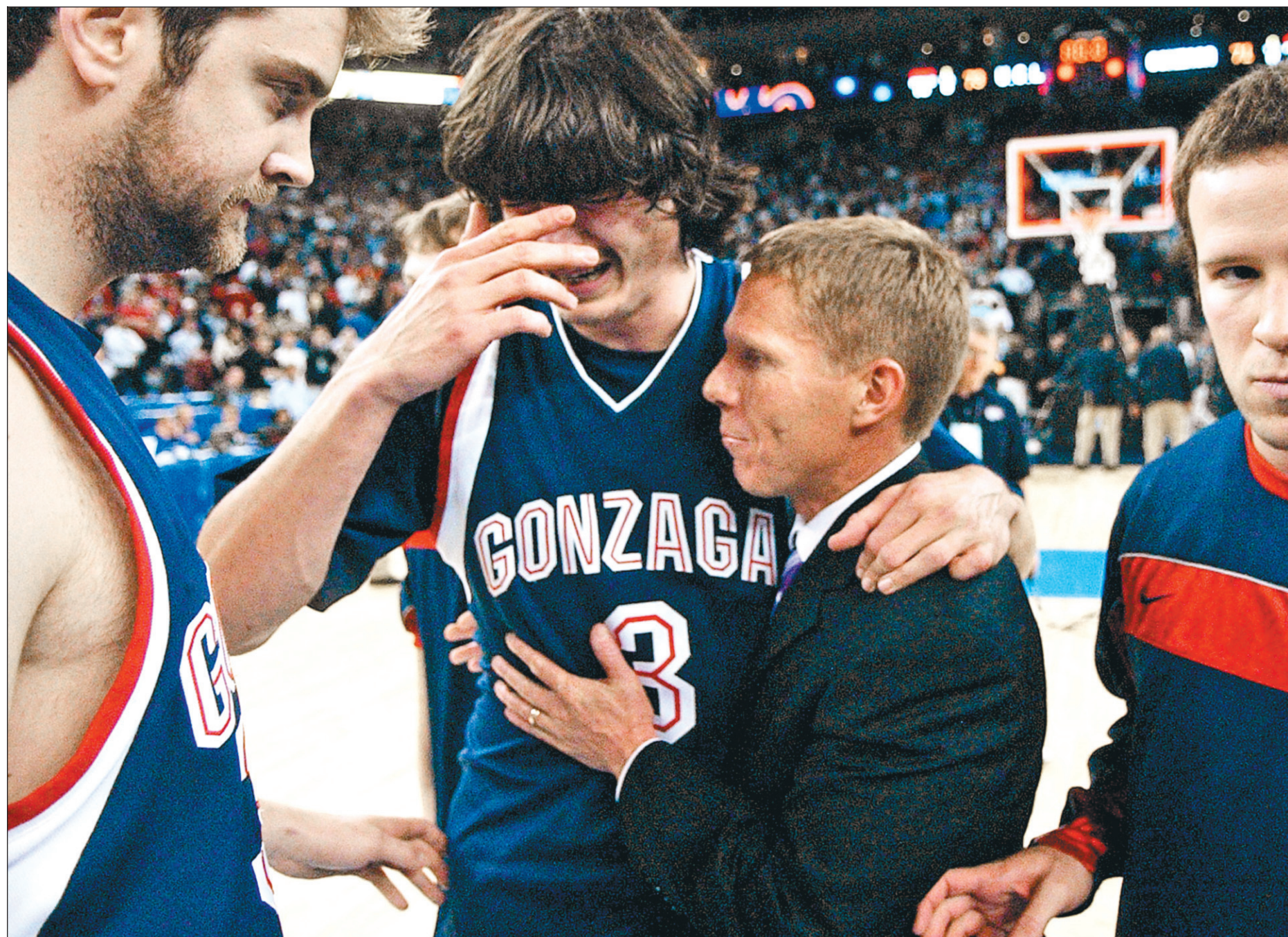
Adam Morrison in consoled by Gonzaga coach Mark Few after what may have been Morrison's final game. The GU forward may skip his senior year to enter the NBA draft.