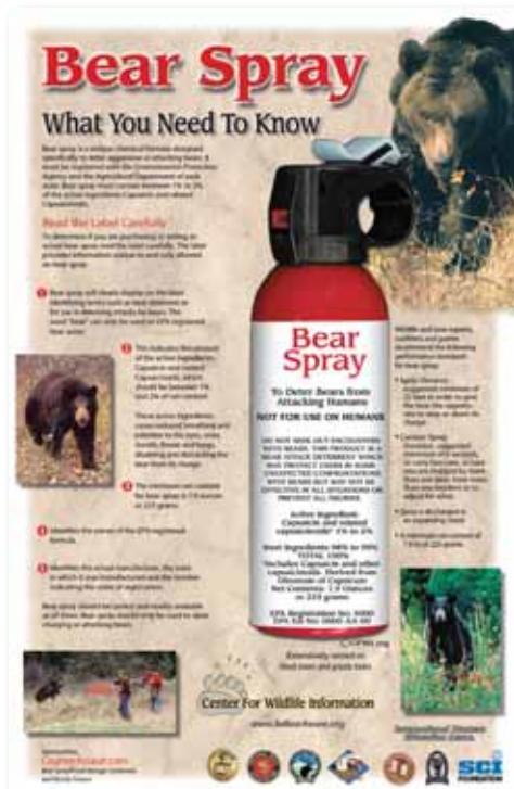
Educational Poster 11x17