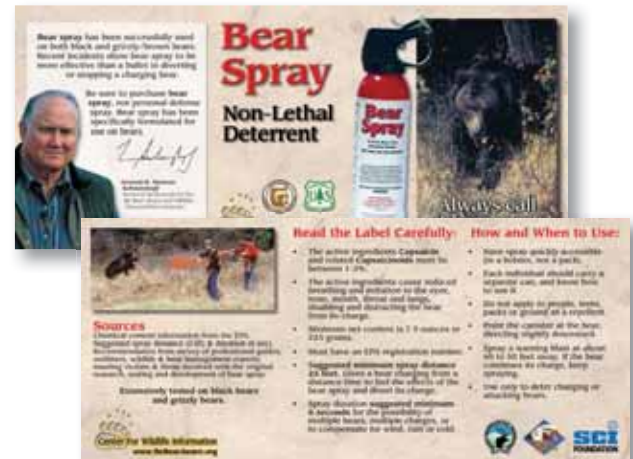
Educational Card 4x9