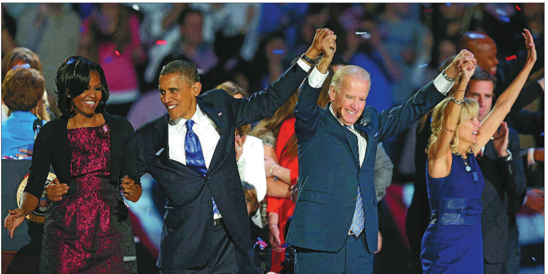
President Barack Obama, first lady Michelle Obama, Vice President Joe Biden and Jill Biden wave during the president's election party early this morning in Chicago.

PRESIDENT EMERGES WINNER AFTER BRUISING CAMPAIGN