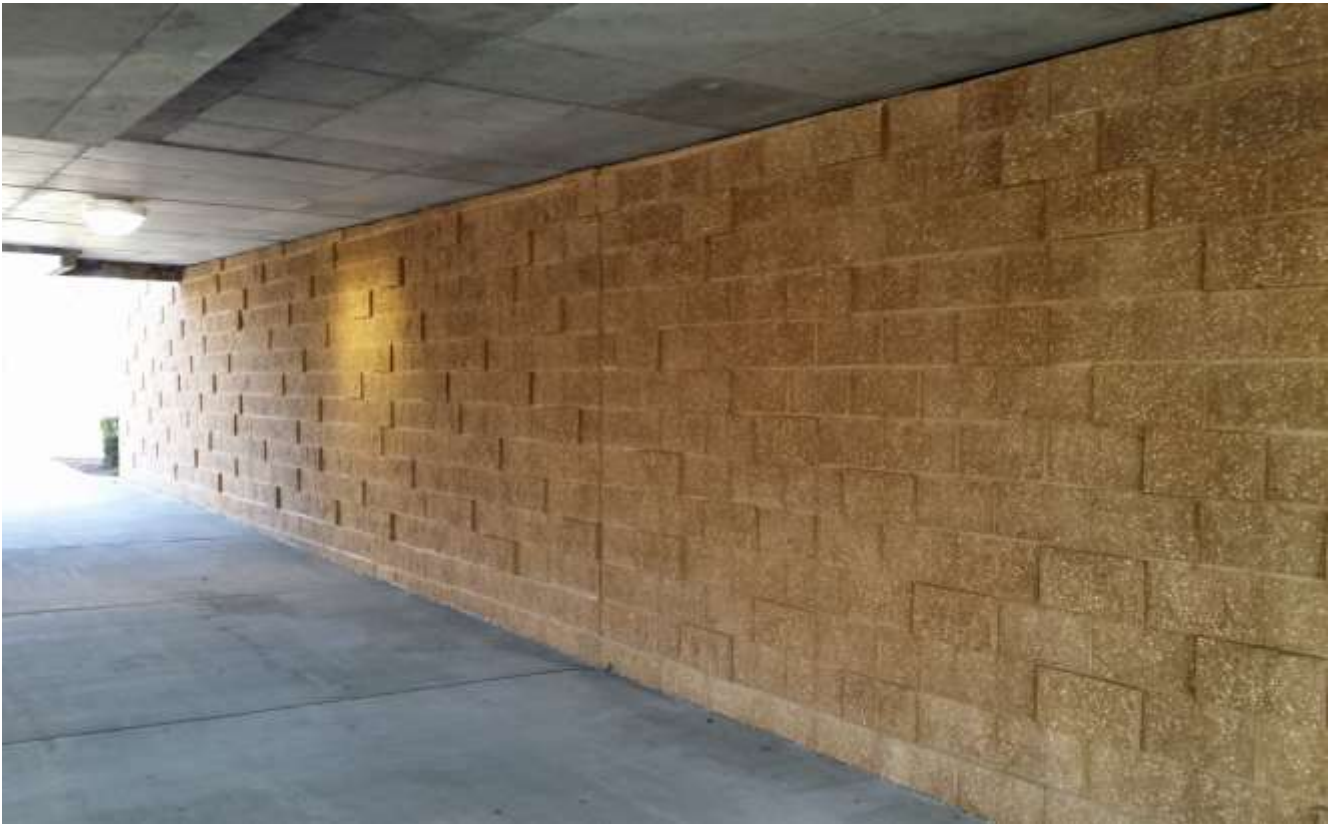
Call to Artists – McEuen Park Wall - 5