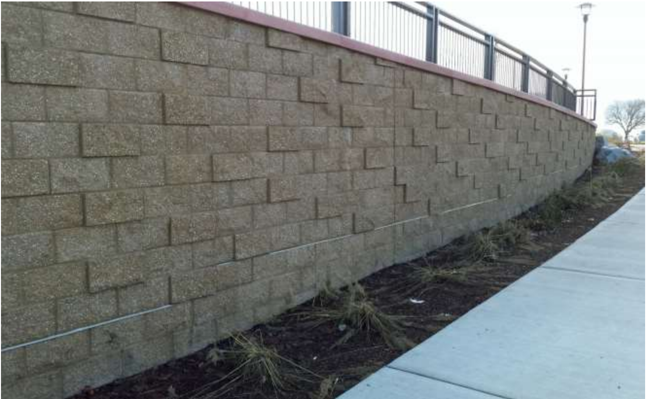
Call to Artists – McEuen Park Wall - 6