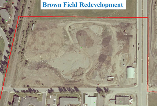
Brown Field Redevelopment