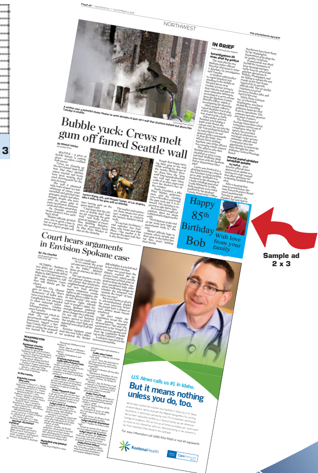
Sample ad 2 x 3

For more information please call 509-456-7355 or commercialclass@spokesman.com